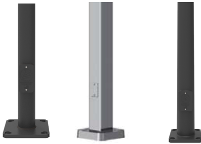
4/5/6" SQ/SQU RP/RPU