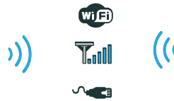
WiFi, Cellular or Ethernet Connection