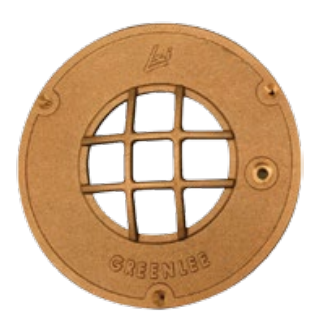
Rock Guard (RGA/B) Lens/Lamp Protection

.18" thick stainless steel trim with radial polish finish Directional Shield - aluminum or brass Rock Guard - aluminum or brass Slip Resistant Lens