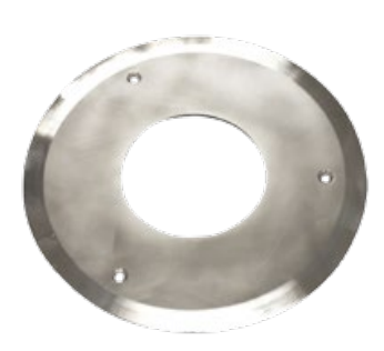
Stainless Steel Trim (SST) Decorative Appeal