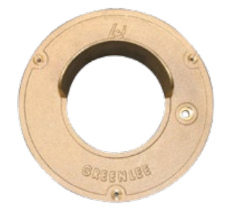
Directional Shield (DSA/B) Increased Light Control