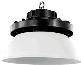
RHB16AL Spun Aluminum Reflector