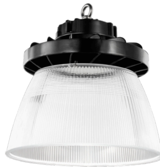
RHB16AC Prismatic Acrylic Refractor