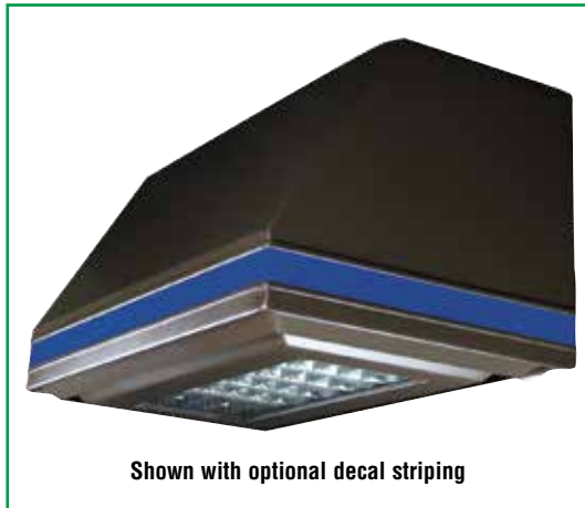
Shown with optional decal striping