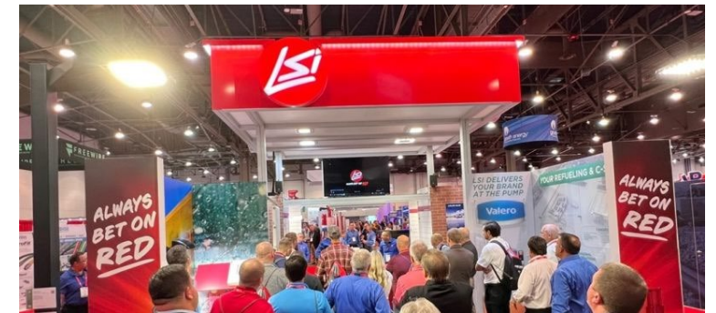
Site & Area