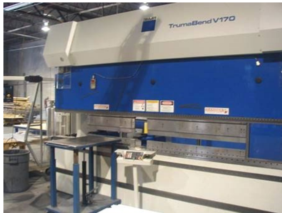
CNC Press Brake