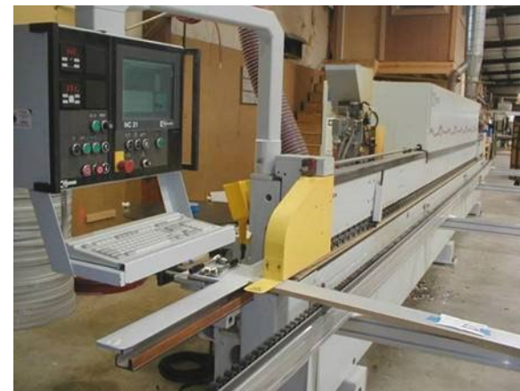
CNC Edge Bander