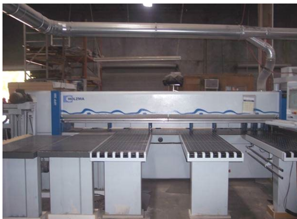
CNC Panel Saw