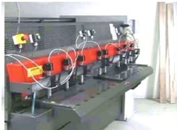
CNC Dowel Machine