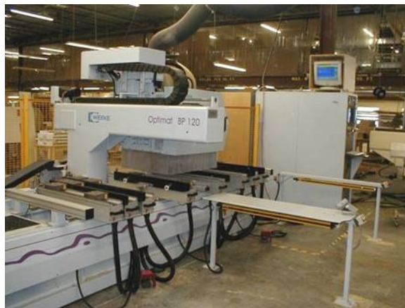
CNC Point to Point