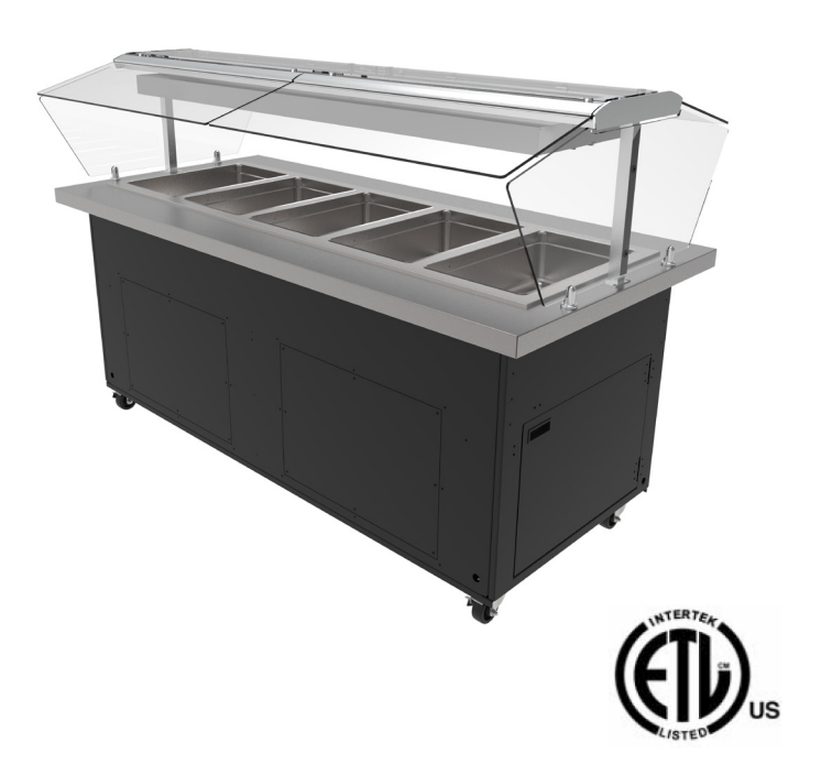
Individual Well Temp Control