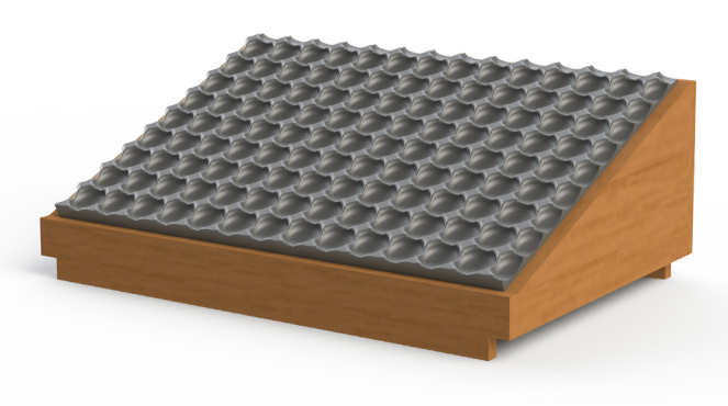
FOAM POCKET PAD